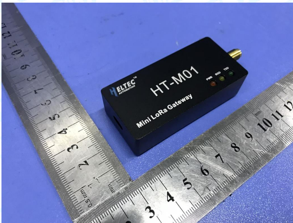
Photo 4 Appearance of EUT