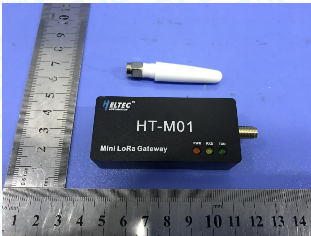
Photo 2 Appearance of EUT